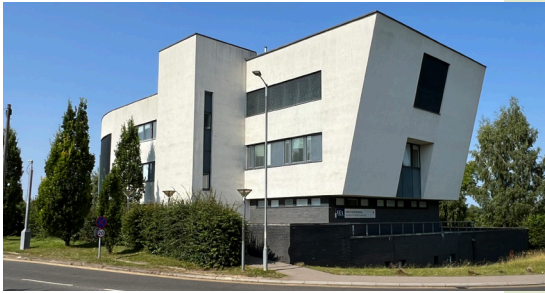
6. Edith Cavell, University of East Anglia - SCHOOL OF ANATOMY