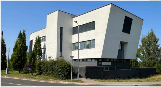
6. Edith Cavell, University of East Anglia - SCHOOL OF ANATOMY