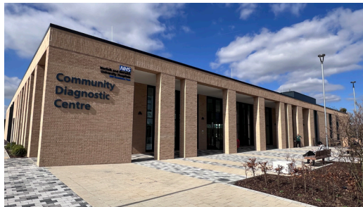
3. Community Diagnostic Centre NHS - HEALTHCARE