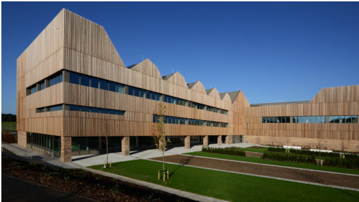
1. The Bob Champion Building - EDUCATION & RESEARCH