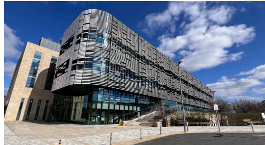
2. The Quadrum Institute - RESEARCH & HEALTHCARE