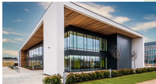
4. Ella May Barnes Building - COMMERCIAL, RESEARCH & HEALTHCARE