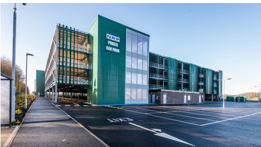
7. NRP Multi Storey Car Park - COMMERCIAL