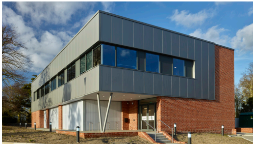
5. Leaf Systems - BIOSCIENCE RESEARCH